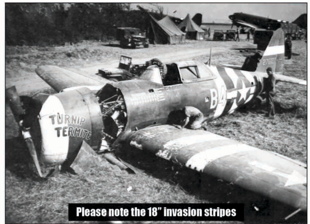
Please note the 18" invasion stripes

Overall scheme: O.D over Neutral Gray. Prop: 12'2" CE prop thought to be plain; no data, CE logo or yellow wing tips. However, complete data is available in the data section for modeler option. Prop hub: NMF. Windscreen mirror is black. Wing insignia: Top left 40". Wing Underside, both wings 50". Fuselage insignia 35" use Version 2. Full invasion stripes; Wing Invasion stripes: Non Standard 5x18". Note outer wing stripe position in image, fuselage stripes: 5x18". Tail stripes: White 12" vertical and 15" stabs (top and underside.)